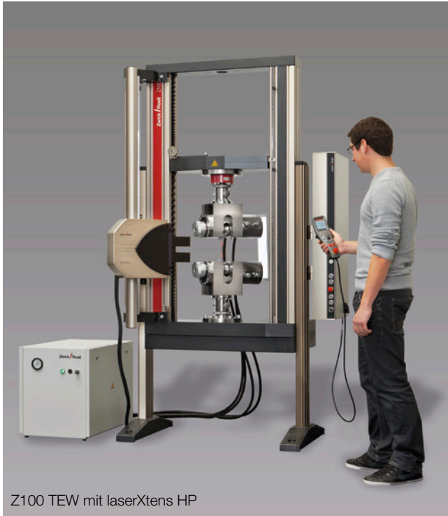
Z100 TEW mit laserXtens HP

Table-top machines Z030 up to Z100 of the Allround-Line