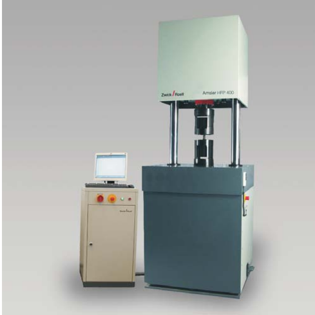
Figure: Amsler 400 HFP 5100