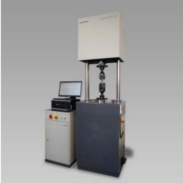
Figure: Amsler 150 HFP 5100