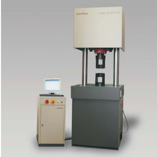
Figure: Amsler 500 HFP 5100