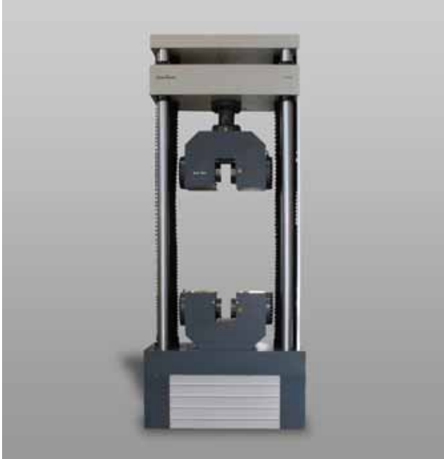
Figure 1: Zwick Z1600E with hydraulic grips