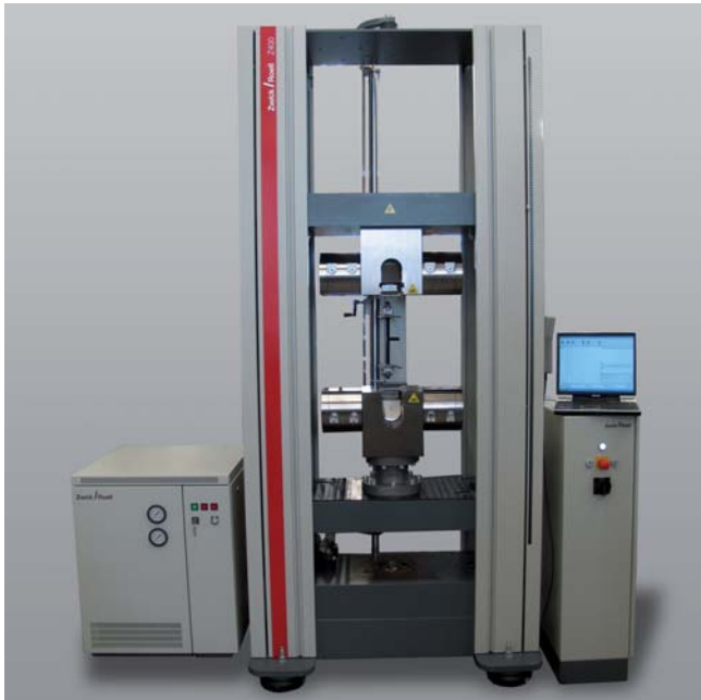
Figure: Zwick Z400E with hydraulic grips

Materials testing machine with ball lead screw drive Z400E / Z400RED