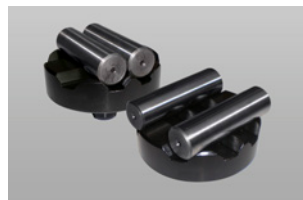
Support tables for round specimens