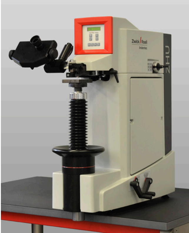
ZHU8187.5 Universal Hardness Tester

ZHU - Universal hardness testers up to 187.5 kg