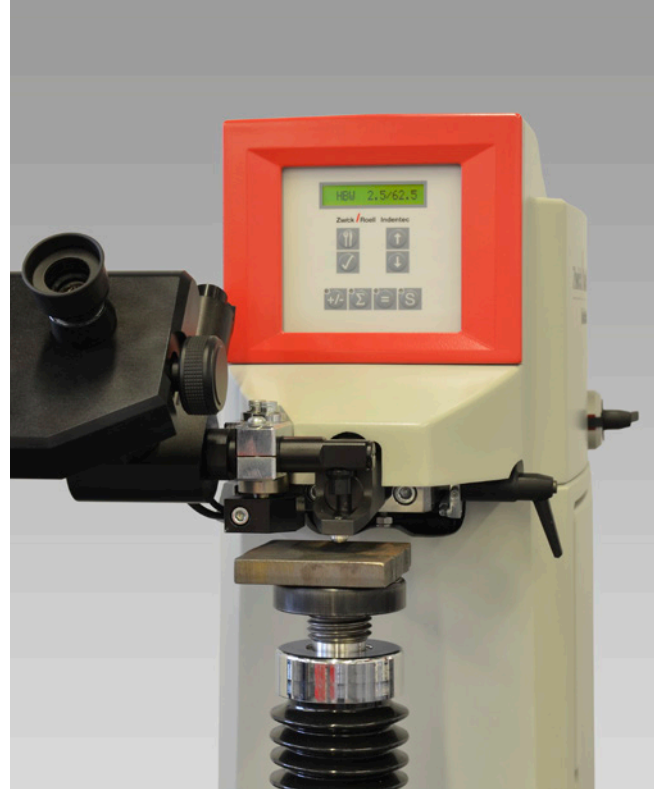
Display of ZHU8187.5 Universal Hardness Tester