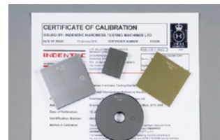
Hardness comparison plate with certificate